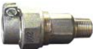
POLYETHYLENE X MIPS PACK-JOINT FITTINGS