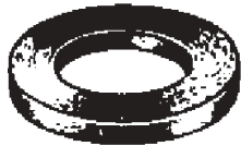
WATER METER COUPLING WASHERS