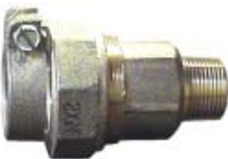
COPPER X MIPS PACK-JOINT ADAPTER