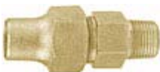
COPPER X MIPS FLARE UNIONS