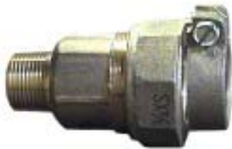
AA LEAD X MIPS PACK-JOINT ADAPTER