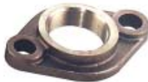
BRASS WATER METER FLANGES