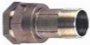
WATER METER COUPLINGS WITH WASHER Brass