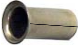
STAINLESS STEEL INSERT FOR PE PIPE