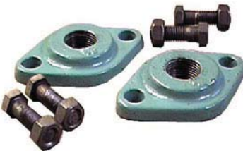
MALLEABLE IRON CIRCULATOR FLANGE KITS