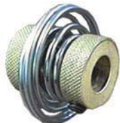
BRASS SPRING COUPLER FOR B & G