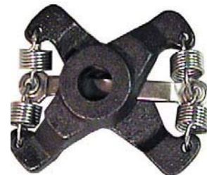
CIRCULATOR COUPLING FOR B&G