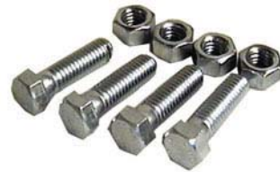
CIRCULATOR FLANGE NUTS AND BOLTS