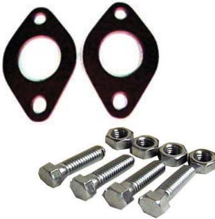
CIRCULATOR FLANGE REPAIR KIT