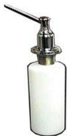
LIQUID SOAP DISPENSER