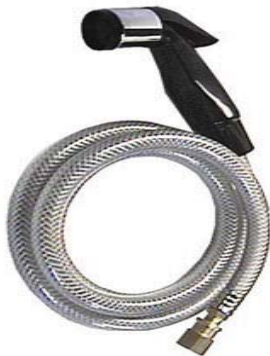
“CROWN-RINSE” HOSE & SPRAY ASSEMBLIES

- All “Crown-rinse” products are individually boxed