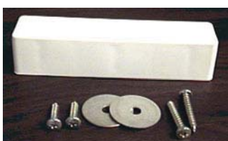
LAUNDRY TRAY FAUCET MOUNTING BLOCKS