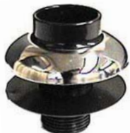
“CROWN-RINSE” HOSE GUIDES