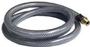
“CROWN-RINSE” REPLACEMENT HOSES

- All “Crown-rinse” products are individually boxed - Standard Hose/Spray is furnished with 1/8” F x 1/4”F adapter - Delta H/S furnished with 1/2” Female Swivel