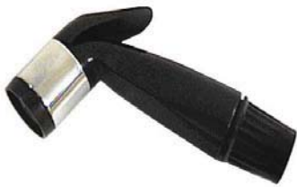
“CROWN-RINSE” SPRAY HEADS