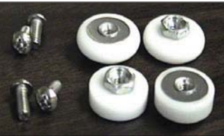
NYLON SHOWER DOOR ROLLERS