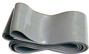
VINYL SHOWER DOOR SEAL