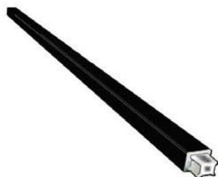
PLASTIC "REPLACE-A-BAR" TOWEL BARS