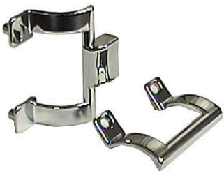
SINGLE-TOWEL BAR SHOWER DOOR HANDLE SET