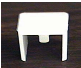
NYLON SHOWER DOOR GUIDE