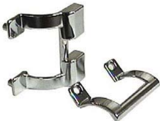
DOUBLE-TOWEL BAR SHOWER DOOR HANDLE SET