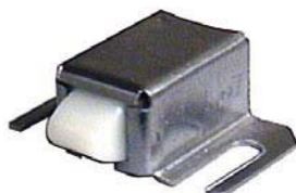
SHOWER DOOR LATCH