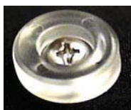
SHOWER DOOR BUMPER