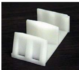
NYLON BOTTOM SHOWER DOOR GUIDE