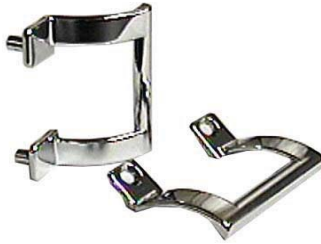
STANDARD SHOWER DOOR HANDLE SET

Note: Shower door handle measurements are center-to-center of screw holes.