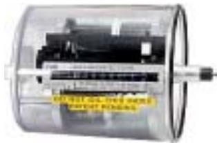
Mechanical Index Accessories (counters)