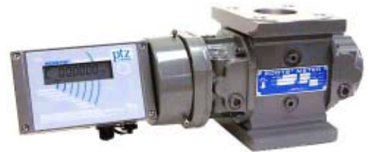
Complete Electronic Metering Solutions (Correctors, Pulsers, Etc.)

GE/Dresser's Roots Meters and Instruments are available for natural gas submeter applications. Applications include: