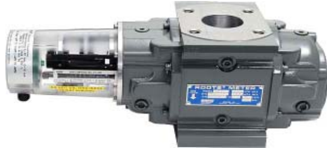
Series B3 Rotary Meter