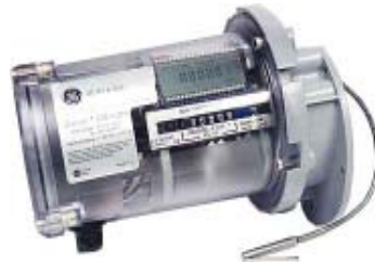
Electronic Index Accessories (counters)