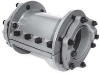
Dual purpose sleeve for emergency repair or hot tapping CIP