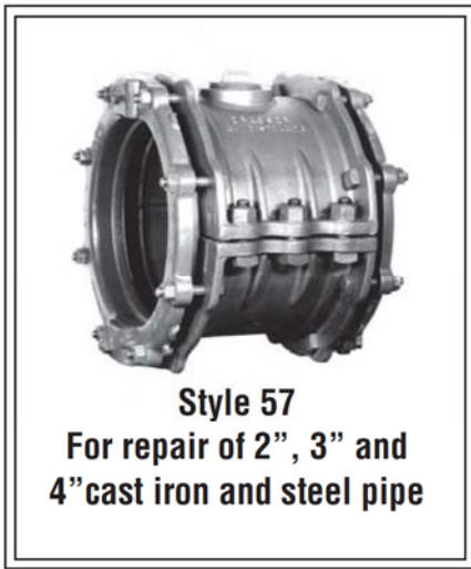
Style 57 For repair of 2", 3" and 4" cast iron and steel pipe

Materials of Construction Consult Factory Per Application