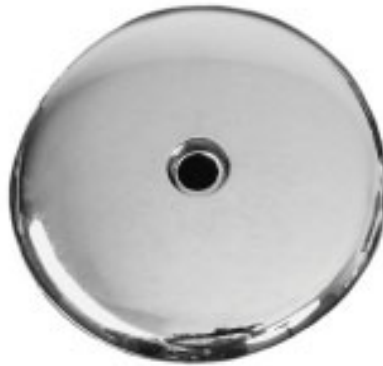
0531002 Blank 1 Hole