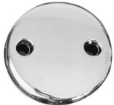
0626006 Blank 2 Holes