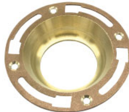
1352002 4" x 3" for Lead