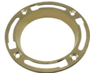
1350002 4" Deep