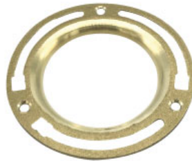
1349002 4" Regular