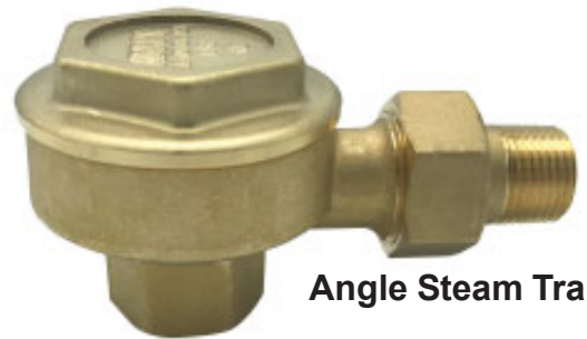
Angle Steam Trap

Pressure: 25" Hg to 25 psi Capacity: 700 EDR