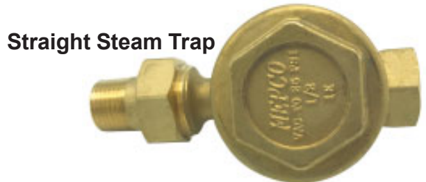
Straight Steam Trap